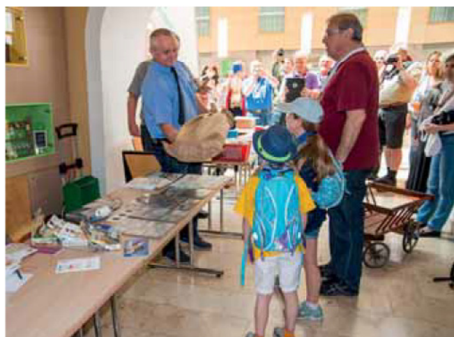
Two Young scouts girls carried a bag of letters in a wheelbarrow through the streets to the post table located in the exhibition

Although most of the exhibition is non-competitive, there is a competitive part with special rules, which can be summarized as follows: new collections, not new but never exhibited before collections and exhibits with all kinds of material (open philately). These opt to the Walter Grob Prize, established by his family in memory of the renowned Swiss collector.