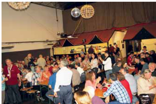
Most exhibits were non-competitive, but plenty of interest for the Scout's collectors